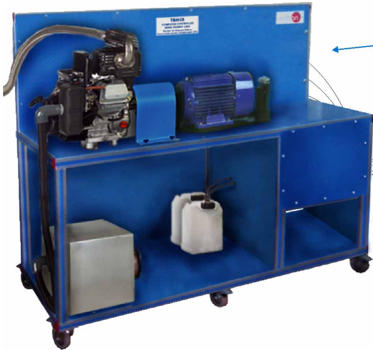
① Unit: TBMC8. Test Bench for Single-Cylinder Engines, 7.5 kW.