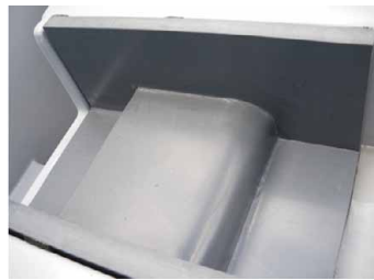
Broad crested weir