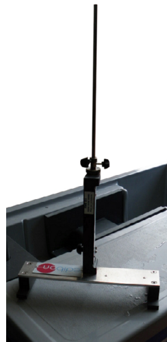
Hook and point gauge