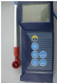
Current velocity meter