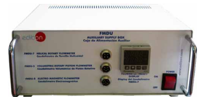
Auxiliary supply box